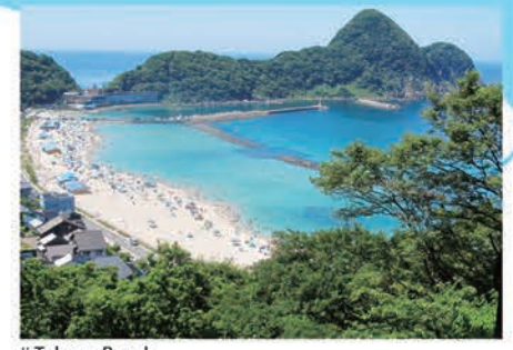
# Takeno Beach