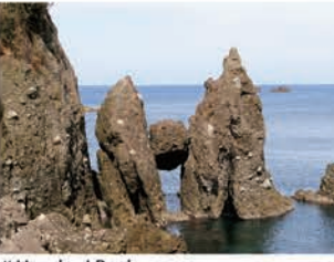
# Hasakari Rock