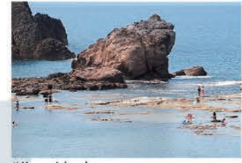
# Kaeru Island