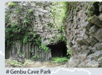
# Genbu Cave Park