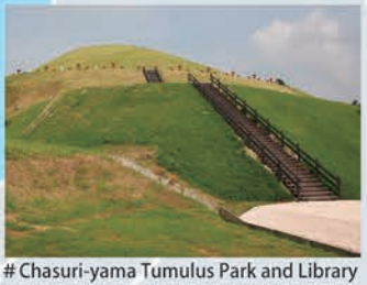
# Chasuri-yama Tumulus Park and Library