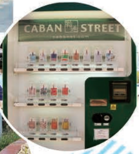
# Kaban Street