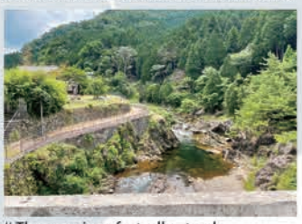
# The remains of a trolley track along the Ichikawa River