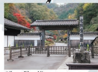
# Ikuno Silver Mine